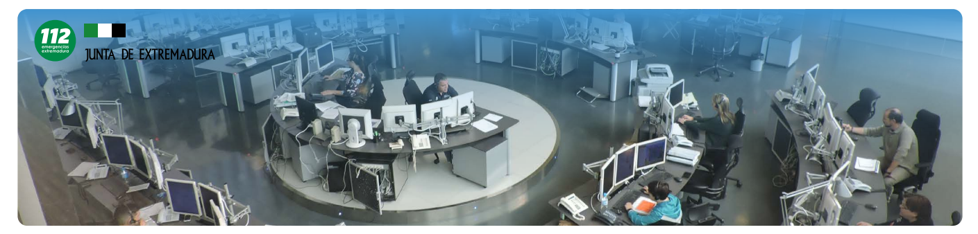
Atos global and modular Public Safety offering: from infrastructure and integration to support