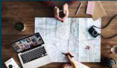
BUSINESS MODEL DEVELOPMENT