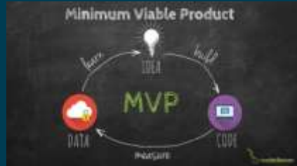
PROTOTYPING & MVP