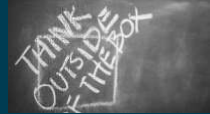
PROBLEM FRAMING & IDEATION