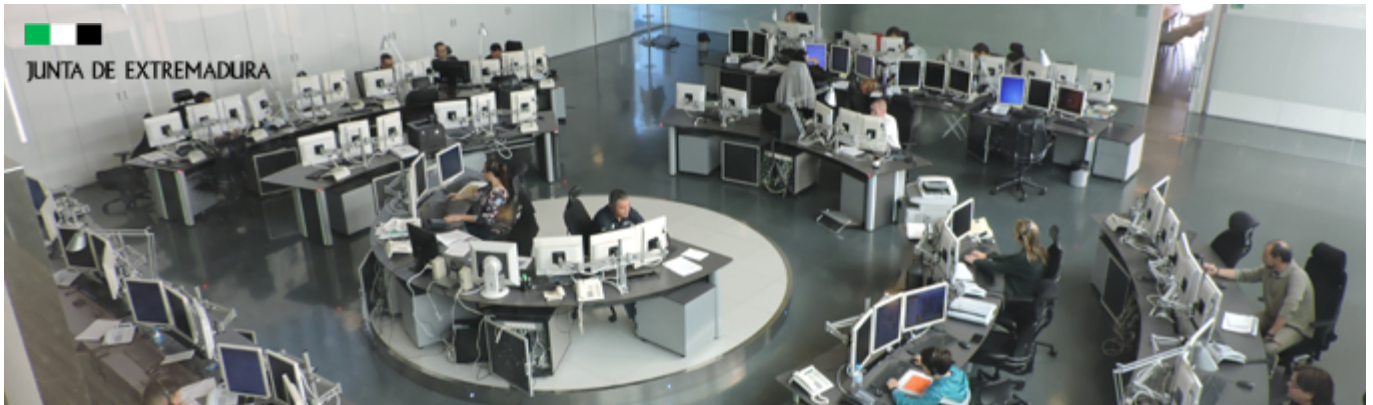
Atos global and modular Public Safety offering: from infrastructure and integration to support