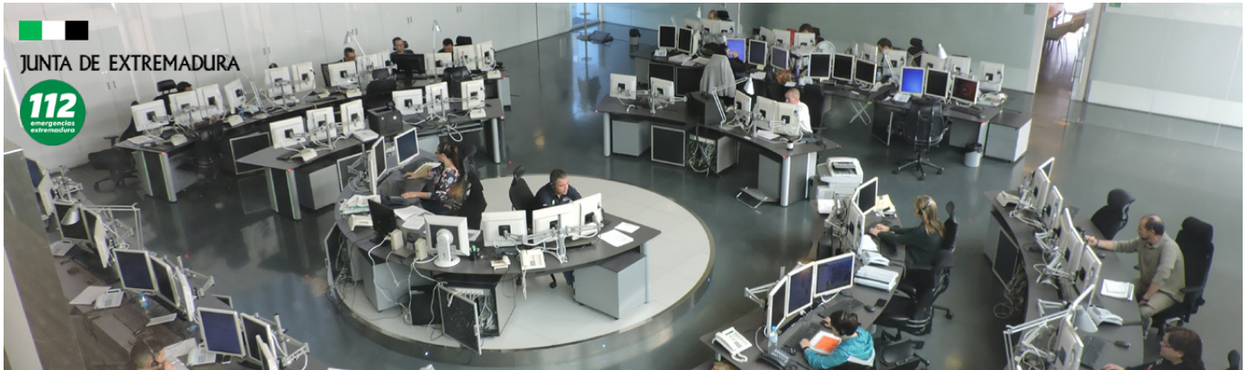
Atos global and modular Public Safety offering: from infrastructure and integration to support