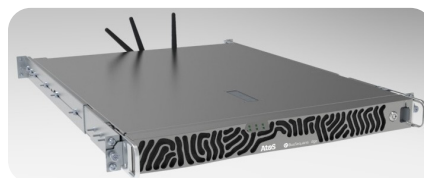
BullSequana Edge EXR